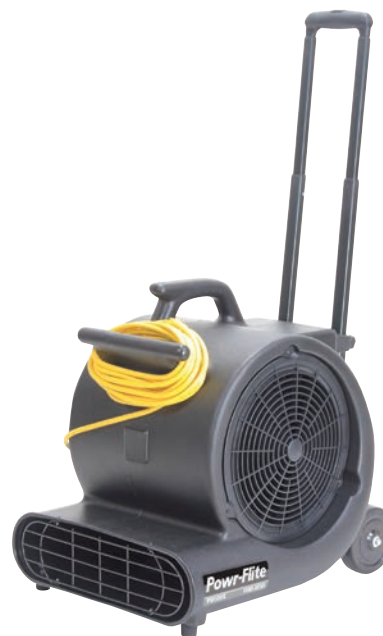
PD500DX model includes telescoping handle.

Powr-Flite COMMERCIAL FLOOR CARE EQUIPMENT