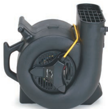
Easy vertical operation.

Epoxy coated thin steel wire grills for safety and maximum air flow in a stackable design.